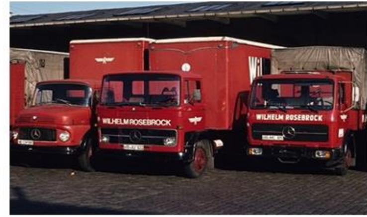
Autumn 1980: Three Generations Mercedes trucks at Bremens' freight train station

Rosebrock receives accreditation as IATA Cargo Agent