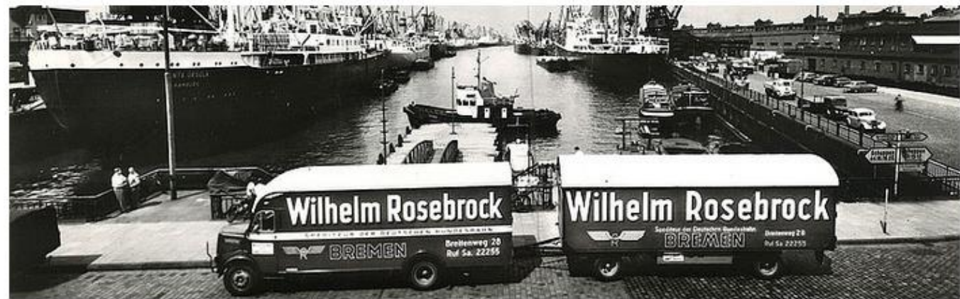
Rosebrock truck in the 50's at the international port of Bremen